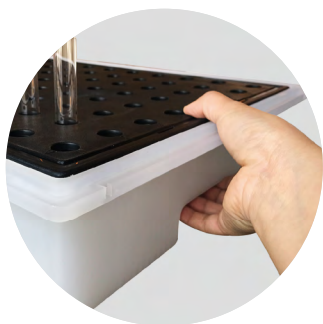
Equipped with handle for easily transporting.