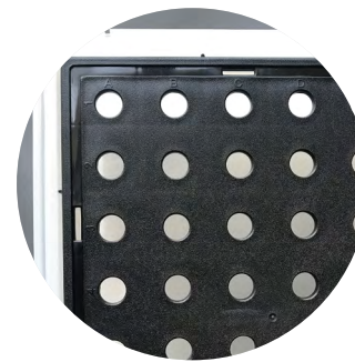
Holes marking with letters & numbers.