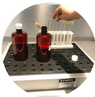
Temporarily place the tubes with the diameter of less than 16mm.