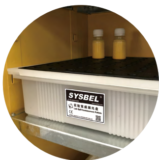
Application for 12Gal or more.