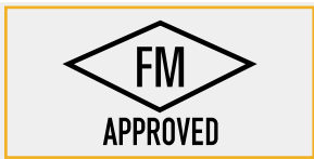
China's first certified by FM